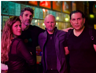
Jaws of Brooklyn August 9, 2022 5:00PM Westlake Park

Downtown Summer Sounds 2022 (downtownseattle.org)