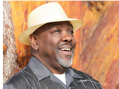
Wanz August 24, 2022 12:00PM Rainier Tower